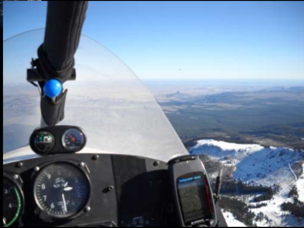
Right: Over the top, 12,500 ft.