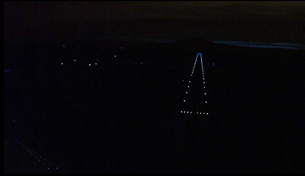
Lower left: My second landing on Runway 21. Note the silhouette of Ladron Peak beyond the far end of the Runway.