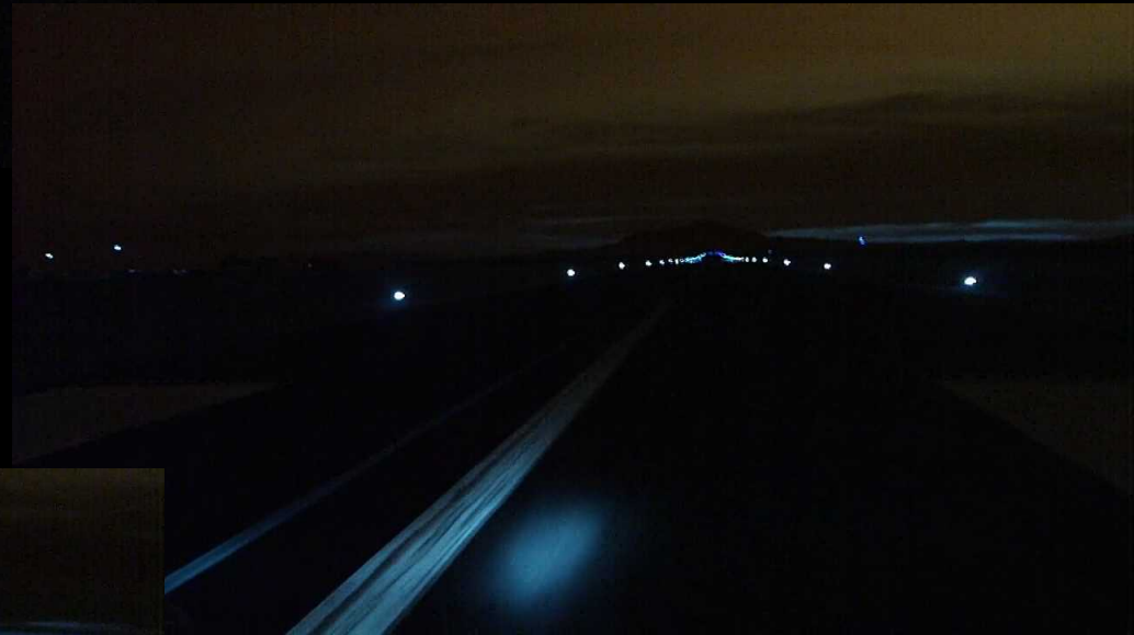
Right: I set down very smoothly. Even did a wheelie landing. It was so nice, I went up and around again for some more practice.